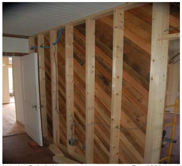
Interior Dubois House