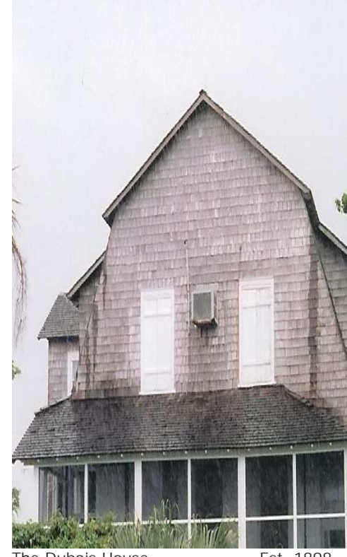
The Dubois House