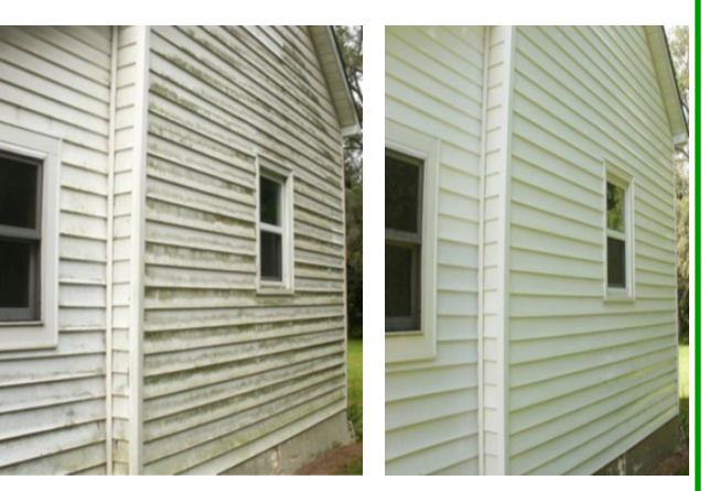
Before and After Vinyl Siding soft wash

As a result of winning bids, Morgan accredits his SMWBE certification status with allowing his business to invest in the community by employing individuals and training them to utilize the cleaning system professionally and effectively.