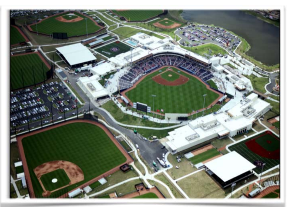
Ballpark of the Palm Beaches