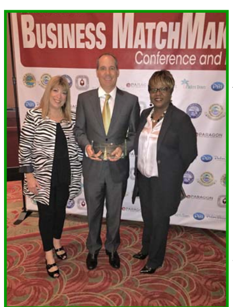
2015 SBE Business of the Year

Their core values of Safety, Integrity, and Accountability drive their daily decision-making and assist them in maintaining their commitment to delivering exceptional projects while maintaining social responsibility. LEBOLO takes responsibility for all processes and services rendered. Clients appreciate their "Open Book" approach and straightforward assessment of costs and timelines. They become an extension of their clients' staff, consistently delivering projects on time and within budget.