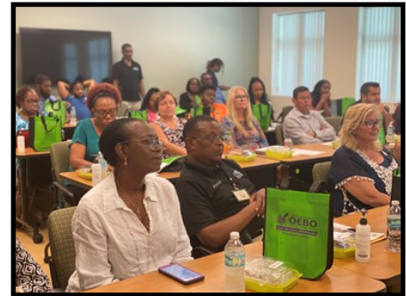
Small Business Week Lunch and Learn