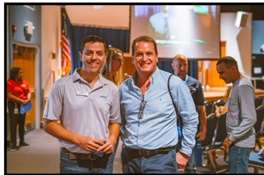
Hard Hats & Suits