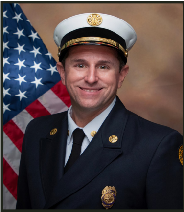
Patrick Kennedy, Fire Chief

Palm Beach County Fire Rescue (PBCFR), is a family. The Core Values of Compassion - Integrity - Unity - Accountability - Dedication, is practiced and the Vision Statement "Excellence Today, Improving Tomorrow" is implemented every day. At PBCFR there are numerous disciplines within the scope of practice that make this the best Fire Rescue Department in the Nation!