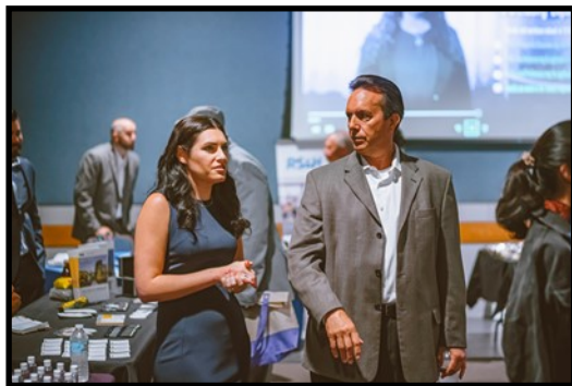
Hard Hats & Suits