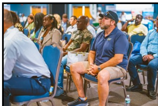
Hard Hats & Suits