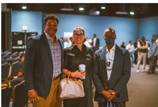
Hard Hats & Suits