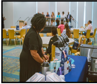
A guest enjoys Ocean Coffee