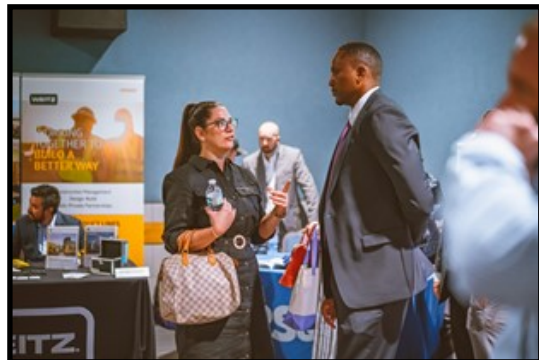
Guests taking the opportunity to network at Hard Hats & Suits