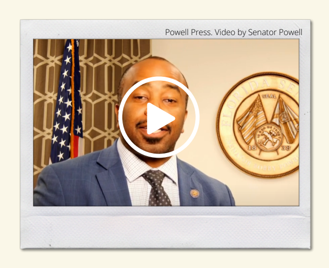
Senator Powell gives an update on the legislative session from his perspective.