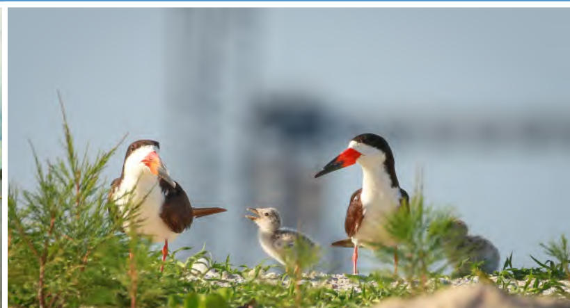
Top: In August 2015, volunteers planted thousands of marsh grasses and mangroves at the Grassy Flats Restoration Project in central Lake Worth Lagoon. Middle: In August 2016, lush wetland grasses covered portions of the intertidal islands created as part of the 13-acre Grassy Flats project. Bottom left: Grassy Flats construction included the use of conveyors and sand shooters. Bottom right: The nesting of state-listed imperiled shorebirds, such as Black Skimmers at project sites in the lagoon is an indication of habitat restoration success.