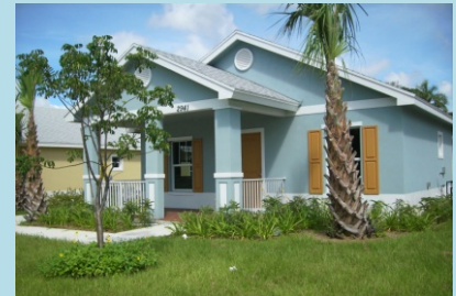
Single Family Home in Westgate