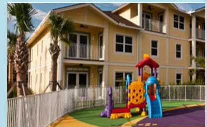
Davis Landings Apts. in Lake Worth